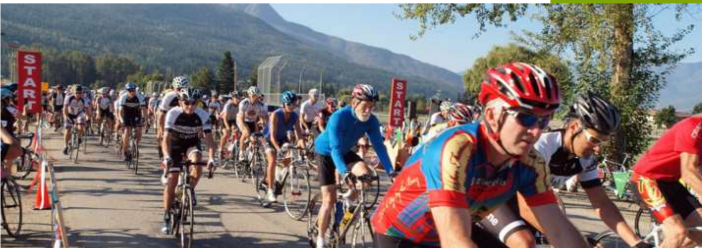
Bike for Your Life Century Ride

The four bike routes are designed to be safe and fun. Whether you have never ridden a bike before, or you are an endurance cyclist join in. Everyone is welcome!