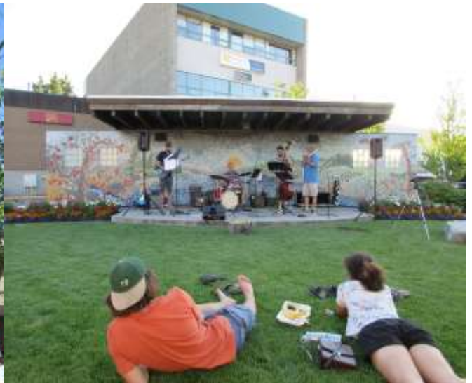
Left: Downtown music schedules now available