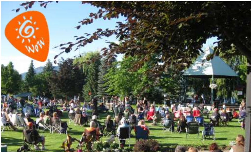
Wednesday on the Wharf