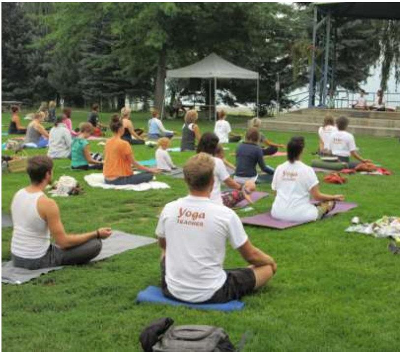
Peace in the Park—Group Yoga—August 29, 2015